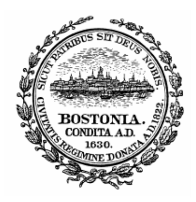
Official Resolution Offered by